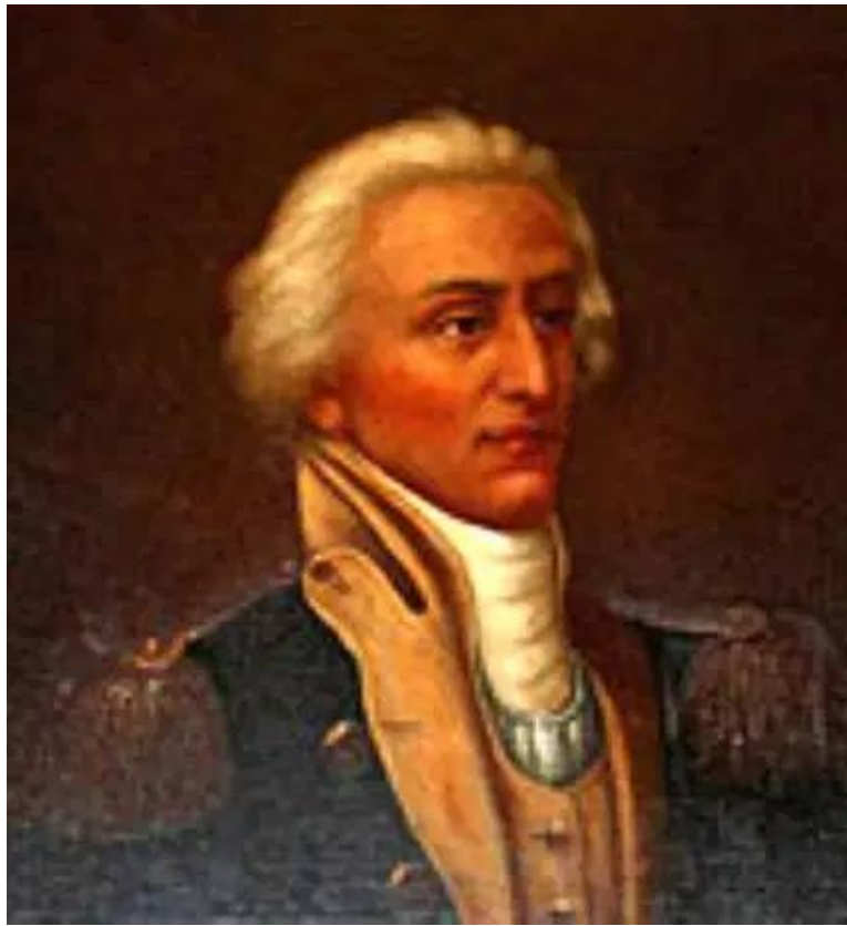
General Francis Marion

"Certain it is, no man has a better claim to the public thanks than you have. History affords no instance wherein an officer has kept possession of a country under so many disadvantages as you have. Surrounded on every side by superior forces, hunted from every quarter with veteran troops, you have found means to elude their attacks, and to keep alive the expiring hopes of an oppressed militia, when all succor seemed to be cut off."