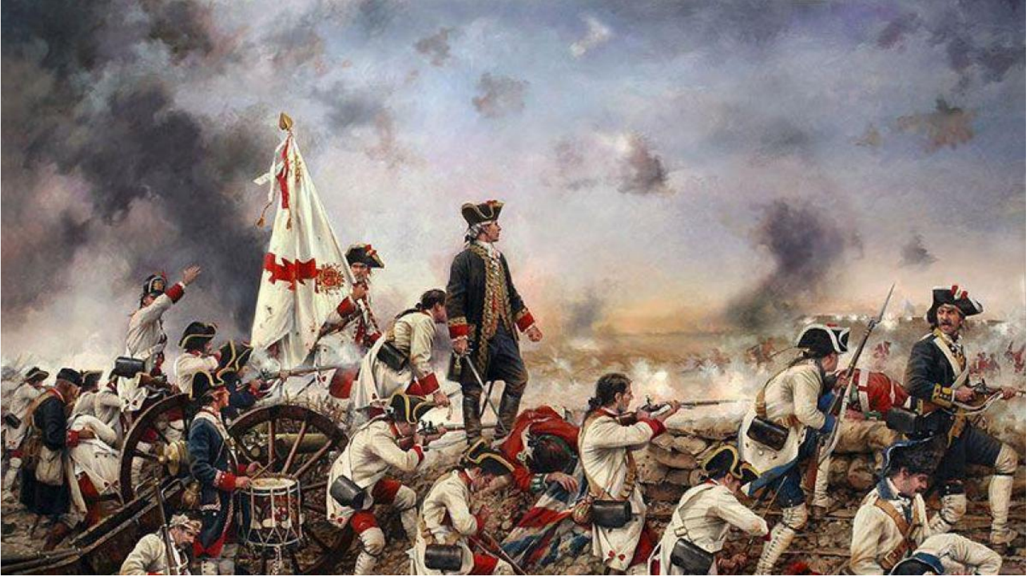
Bernardo de Gálvez leads Spanish troops in the Battle of Mobile, Alabama

As a part of the U.S.A.'s Bicentennial Anniversary in 1976 a bronze equestrian statue of Gálvez was erected in Washington, D.C. to commemorate his service and dedication to the patriot cause. On December 16, 2014, Bernardo de Gálvez was awarded honorary citizenship by the United States Congress and was cited as a hero of the American Revolution.