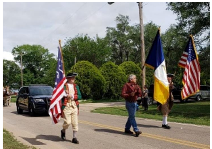
Sons of the Plains chapter leads the Abbyville parade June 27, 2021.