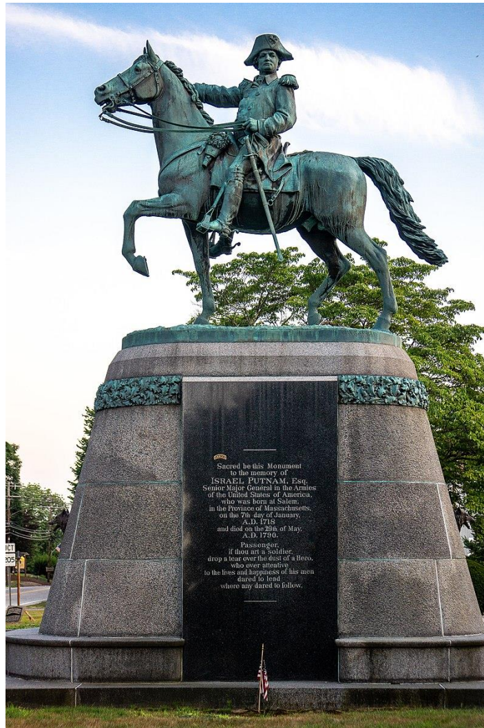
General Israel Putnam

“The enemy advances and you tremble. They've better numbers, you say. Better weapons. Better training. But I do not fear, and neither should you. For what they have in material, they lack in conviction and care. But not us. We have discipline. We have order. And most importantly, we have passion. We believe! So maintain vigilance. Conserve your ammo. Ensure a proper line of sight. And above all else, men, do not fire until you see the whites of their eyes. Then fire low.” – General Israel Putnam