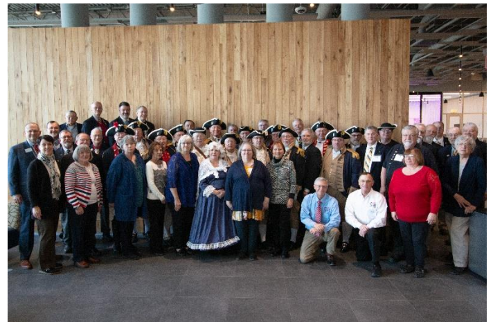
Group photo of all the Compatriots and Lady's Auxiliary members who registered and attended the conference

After the Memorial Service the group retired to the commons area in the Indian Hills Library for group photos.