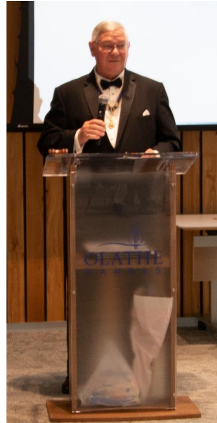
South Central District Vice President General (Arkansas Society) provides his Keynote Address